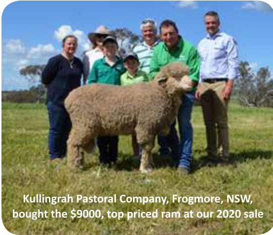
Kullingrah Pastoral Company, Frogmore, NSW, bought the $9000, top priced ram at our 2020 sale