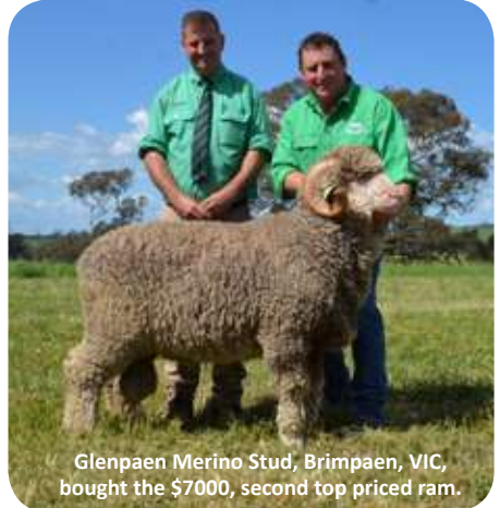
Glenpaen Merino Stud, Brimpaen, VIC, bought the $7000, second top priced ram.